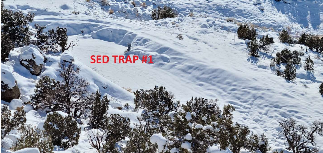
Sediment Trap #1 is empty and clean water flows from trap to pond 018 in normal open condition.