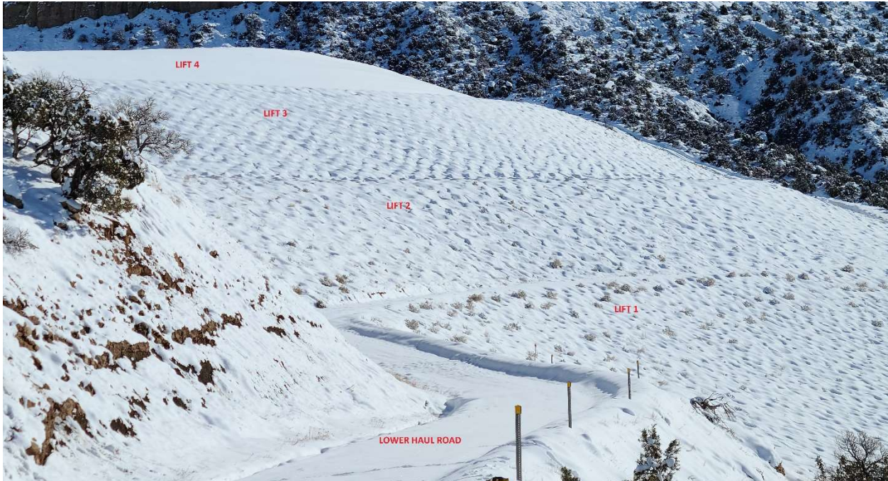
SCA#2 Ash Landfill –looking southeasterly