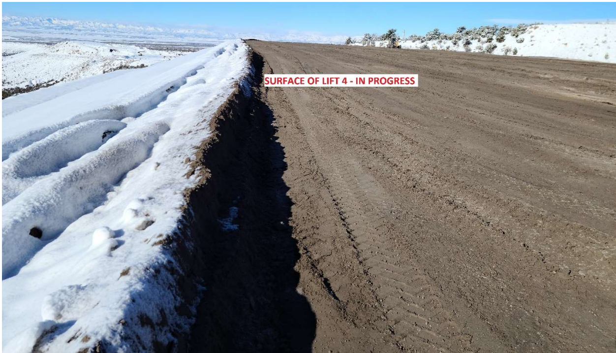
SCA#2 Ash Landfill – Current surface northwesterly Lift #4 in progress